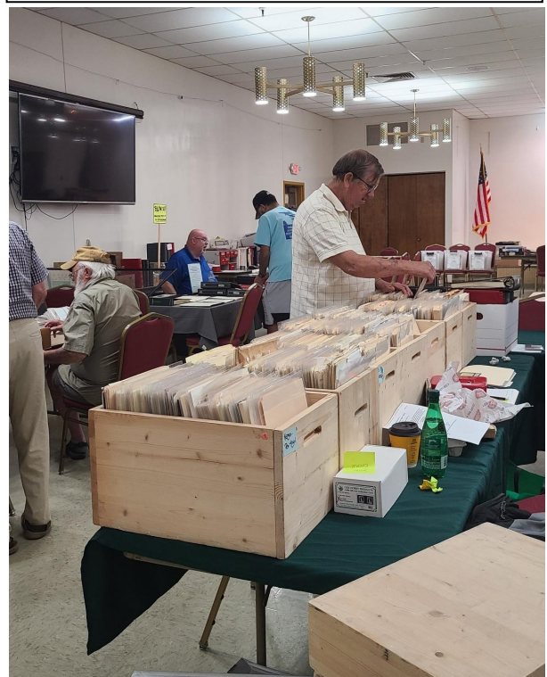
Scenes from the Fall STAMPEX #1