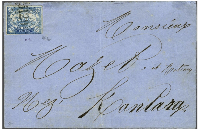
This cover sold at auction for 10,000 Swiss Francs ($11,000)

The charges proved to be very unpopular with the public and stamps were withdrawn from sale in August of 1868 and the service was taken over by the Egyptian government. Since the period of use was so short used stamps from this issue are very scarce and covers with them are very rare indeed.