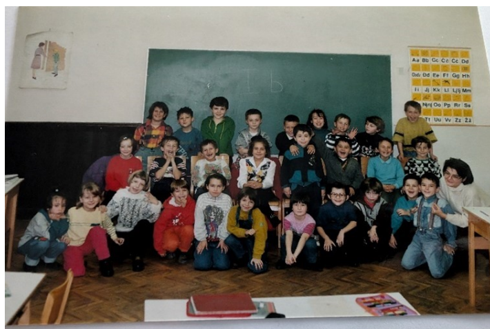
This was the entire class photo with the teacher at the lower right.