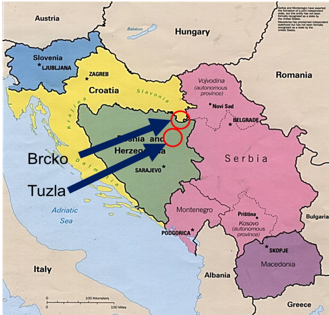
Map showing Bosnia & Herzegovina—one of the states of former Yugoslavia

The 1 st Armored Division was the first force to enter Bosnia in December 1995. Elements of the 1st Armored Division entered Bosnia for the second time in October 1997 relieving the 1 st Infantry Division.